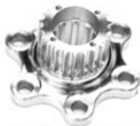
ALUMINUM HTD HUB STEEL HTD HUB