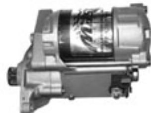
MASON RACIN' STARTER