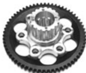
FLYWHEEL RING CHEVY