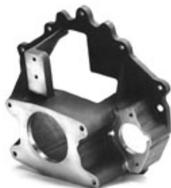
BERT BELLHOUSING CHEVY GILMORE BERT BELLHOUSING CHEVY HTD