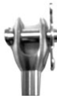
BERT CLEVIS FOR SHIFTER

***SPECIFY DRIVESHAFT LENGTH BRINN 36" AND 36-1/2" BERT 39" AND 39-1/2"