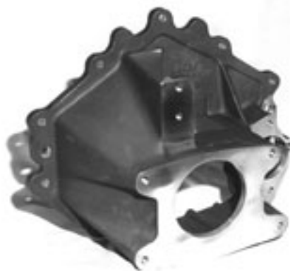
BERT MAGNESIUM BELLHOUSING