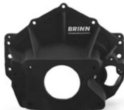
BRINN CHEVY BELLHOUSING BRINN FORD BELLHOUSING