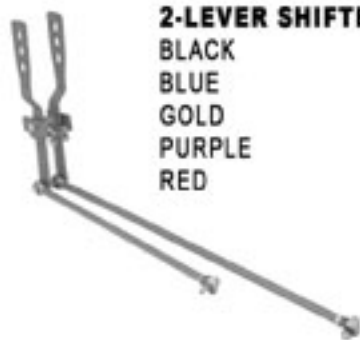
2-LEVER SHIFTER NO LOCK